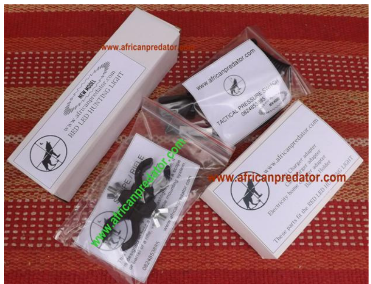
Photo shows the package in original packaging.